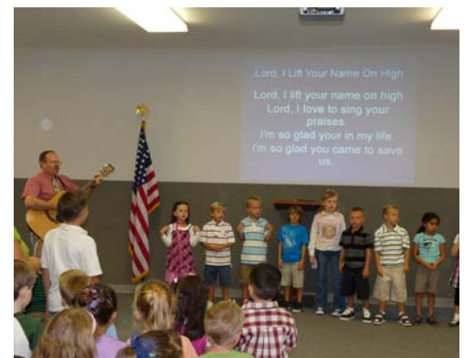
2 nd Graders are leading the songs on the first day of school, opening assembly.

Our theme in the classroom this year is in writing. We are learning to be thorough when answering questions, how to organize our writing work, and how to use writing in math. Native Americans of the United States have been the topic in Social Studies thus far. Thank you to our room mom for all you do for our class.